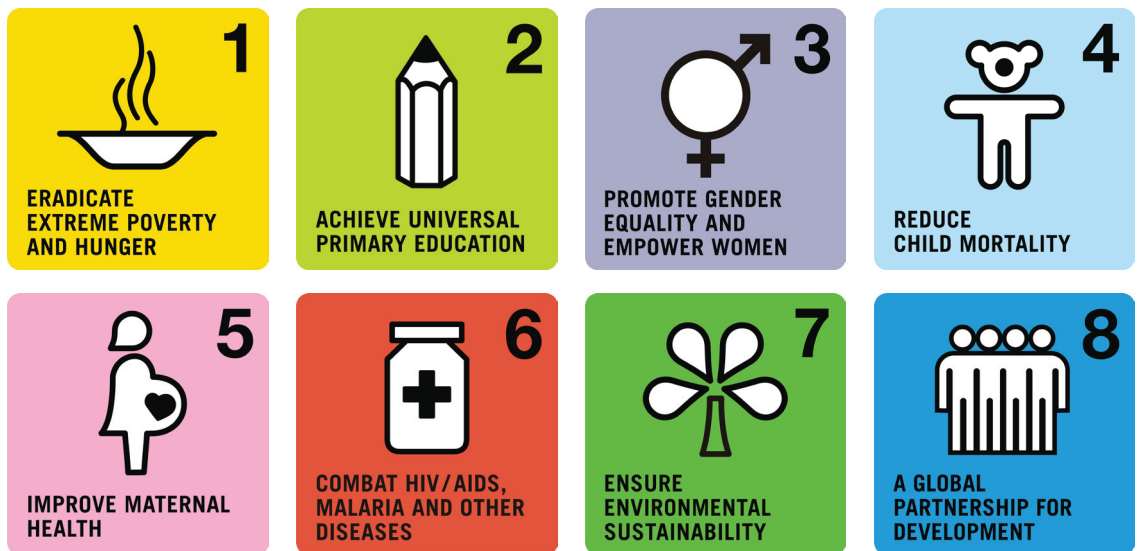
Figure 1: The 8 Millennium Development Goals

to look beyond pipes and powerlines, and must engage with the way we look at ourselves and the world we live in, encouraging progressive values and institutions that promote social cohesion and environmental integrity.